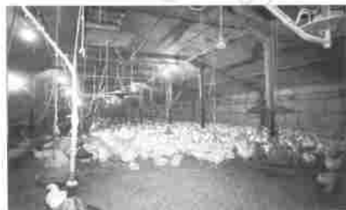
Fig. 5.4 Poultry has the largest share of total livestock in India

However problems related to over- fishing and pollution need to be regulated