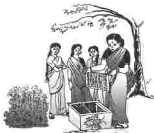
Fig. 5.5 Women in rural households take up bee-keeping as an entrepreneurial activity

Horticulture: Blessed with a varying climate and soil conditions, India has adopted growing of diverse horticultural crops such as fruits, vegetables, tuber crops, flowers, medicinal and aromatic plants, spices and plantation crops. These crops play a vital role in providing food and nutrition, besides addressing employment concerns. Horticulture sector contributes nearly one-third of the value of agriculture output and six per cent of Gross Domestic Product of India. India has emerged as a world leader in producing a variety of fruits like mangoes, bananas, coconuts, cashew nuts and a number of spices and is the second largest producer of fruits and vegetables. Economic condition of many farmers engaged in horticulture has improved and it has become a means of improving livelihood for many unprivileged classes. Flower harvesting, nursery