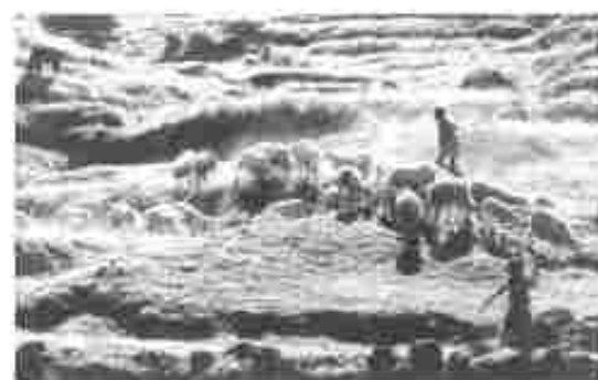
Fig. 5.3 Sheep rearing — an important income augmenting activity in rural areas

followed by others. Other animals which include camels, asses, horses, ponies and mules are in the lowest rung. India had about 303 million cattle, including 110 million buffaloes in 2019. Performance of the Indian dairy sector over the last three decades has been quite impressive. Milk production in the country has increased by about ten times between 1951-2016. This can be attributed mainly to the successful implementation of 'Operation Flood'. It is a system whereby all the farmers can pool their milk produced according to different grading (based on quality), processed and marketed to urban centres through cooperatives. In this system the farmers are assured of a fair price and income from the supply of milk to urban markets. As pointed out earlier Gujarat state is held as a success story in the efficient implementation of milk cooperatives which has been emulated by many states. Gujarat, Madhya Pradesh, Uttar Pradesh, Andhra Pradesh, Maharashtra, Punjab and Rajasthan, are major milk producing states. Meat, eggs, wool and other by-products are