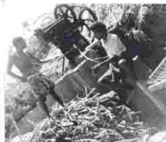
Fig. 5.2 Jaggery making is an allied activity of the farming sector.

greater risk in depending exclusively on farming for livelihood. Diversification towards new areas is necessary not only to reduce the risk from agriculture sector but also to provide productive sustainable livelihood options to rural people. Much of the agricultural employment activities are concentrated in the Kharif season. But during the Rabi season, in areas where there are inadequate irrigation facilities, it becomes difficult to find gainful employment. Therefore expansion into other sectors is essential to provide supplementary gainful employment and in realising higher levels of income for rural people to overcome poverty and other tribulations. Hence, there is a need to focus on allied activities, non-farm employment and other emerging alternatives of livelihood, though there are many other options available for providing sustainable livelihoods in rural areas.