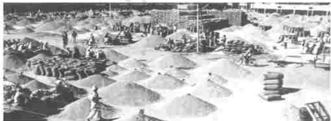
Fig. 5.1 Regulated market yards benefit farmers as well as consumers

Let us discuss four such measures that were initiated to improve the marketing aspect. The first step was regulation of markets to create orderly and transparent marketing conditions. By and large, this policy benefited farmers as well as consumers. However, there is still a need to develop about 27,000 rural periodic markets as regulated market places to realise the full potential of rural markets. Second component is provision of physical infrastructure facilities like roads, railways, warehouses, godowns, cold storages and processing units. The current infrastructure facilities are quite inadequate to meet the growing demand and need to be improved. Cooperative